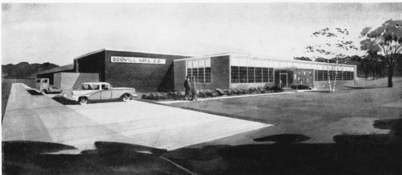
An architect's drawing of our new Cleveland Office and Warehouse

As of December 1st our new Cleveland-Pittsburgh regional sales office and warehouse are located in the "Midwest's First Industrial Park" — the Cleveland Manufacturing Sites at 4635 West 160th Street.